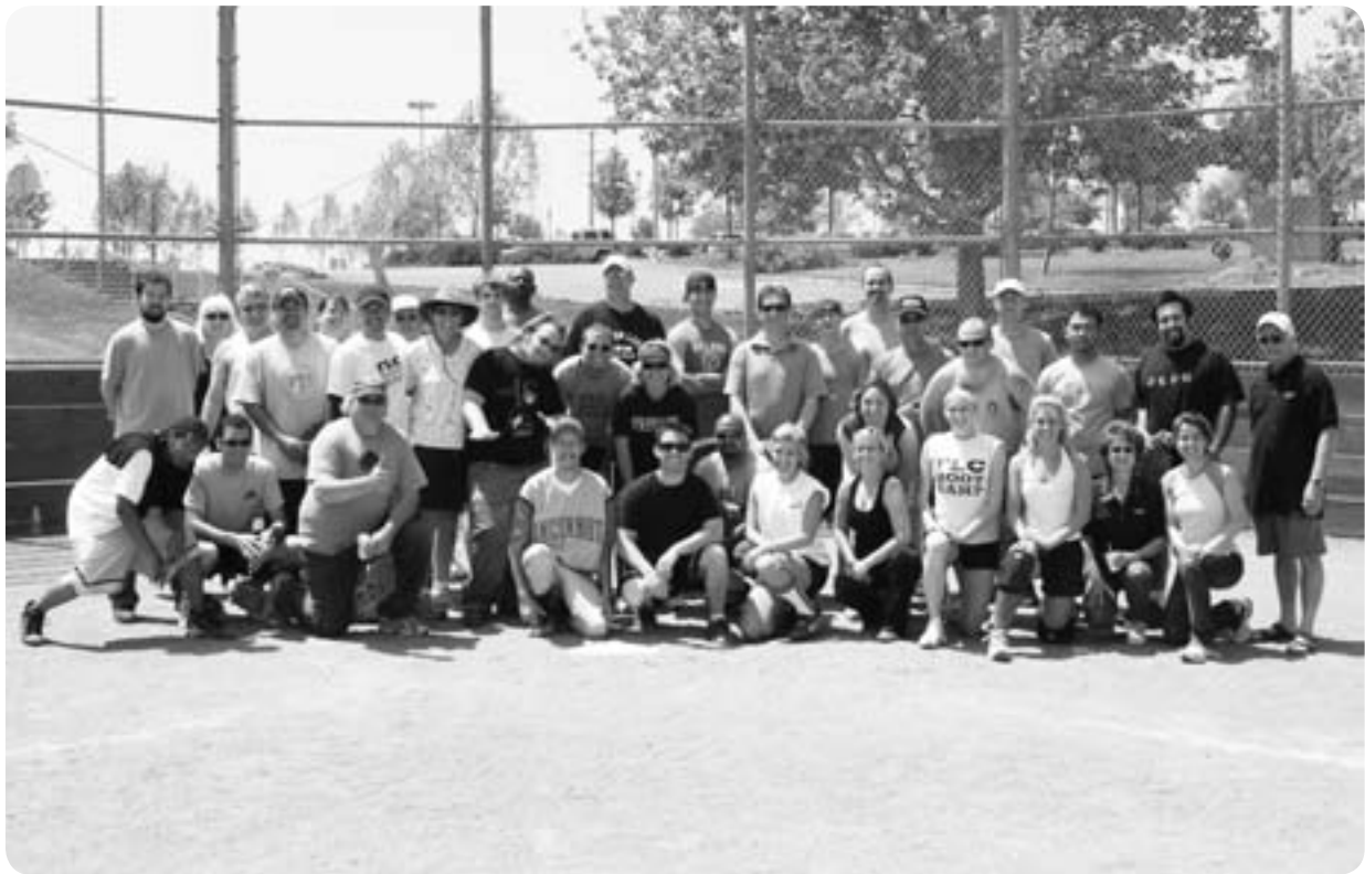
Students, faculty, staff, & administrators pose after the 2006 softball game. Every May, students face off against faculty, staff, & administrators in softball - an annual tradition for Folsom Lake College.

Thank you again for your interest in Folsom Lake College.