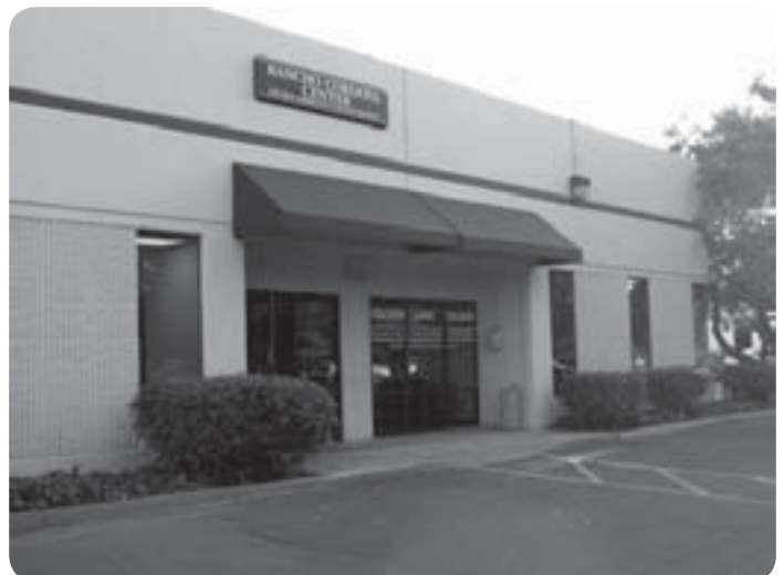
The Rancho Cordova Center

Folsom Lake College promotes student success by providing student centered academic and support services and creating opportunities for employment, internships, and community service.